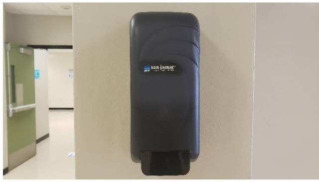
Hand sanitizer dispenser