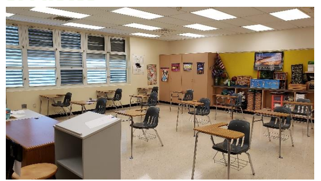
Typical classroom setup (15 seats)