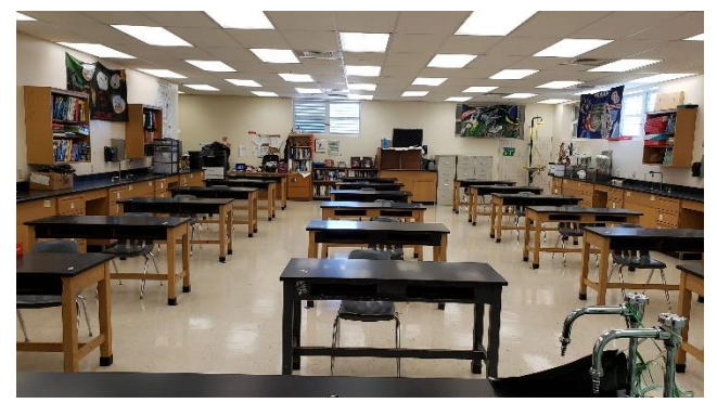
Science classroom (six feet apart)