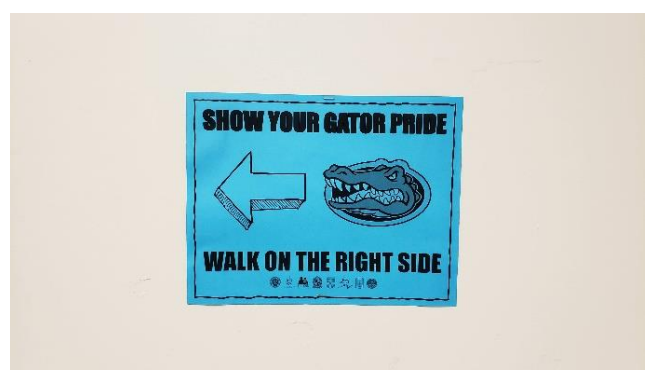
Direction wall sign