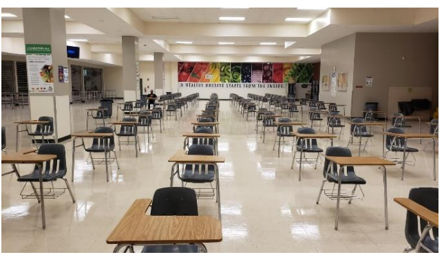
Cafeteria seating (individual desks)