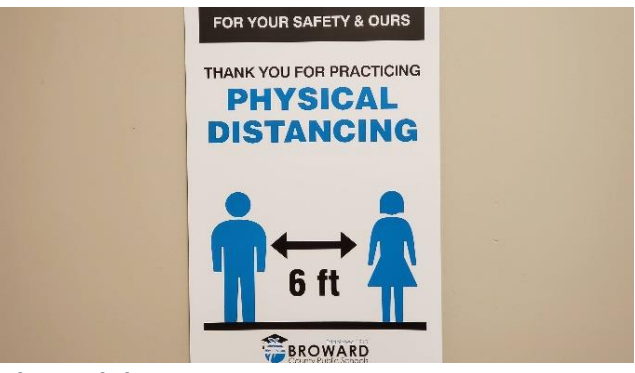
Physical distancing poster