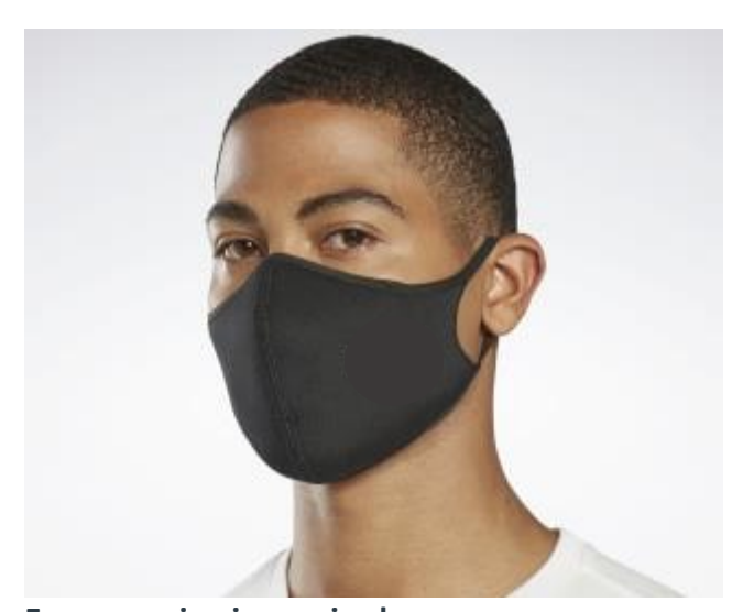
Face covering is required