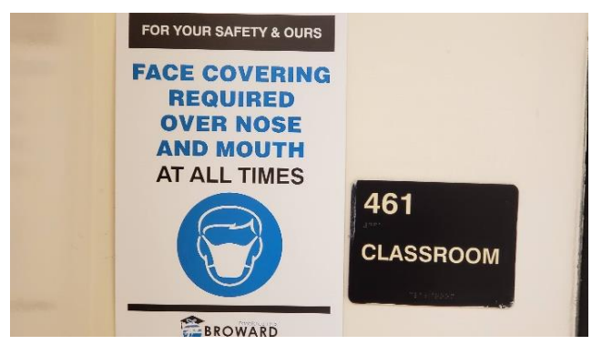
Face covering poster