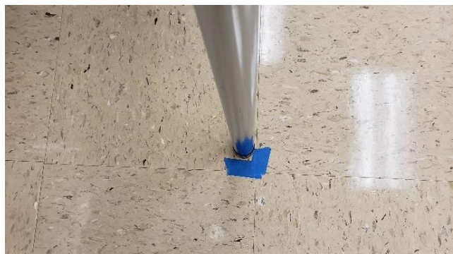
Desk spacing marker (six feet apart)